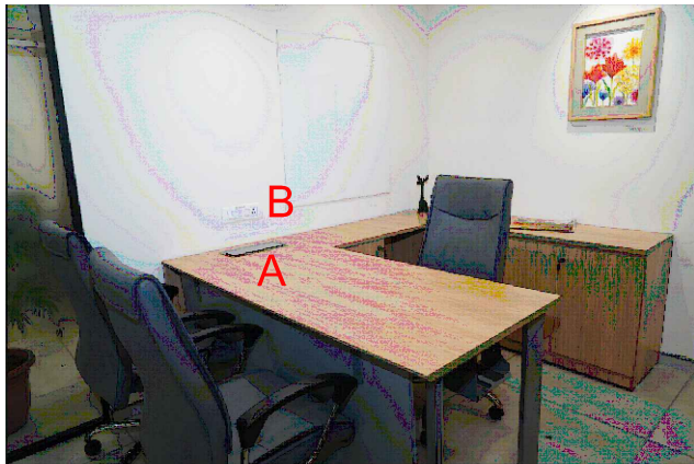
Reference Image For Incharge Room & Survey/Geology Room Switchboard on the table top (Flipup Box).

A) Below mentioned points has been executed at Cabin Table top with Flip up Box:-